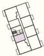
Levels 6 to 10

PLOTS 352 (6), 360 (7), 368 (8), 376 (9), 384 (10)