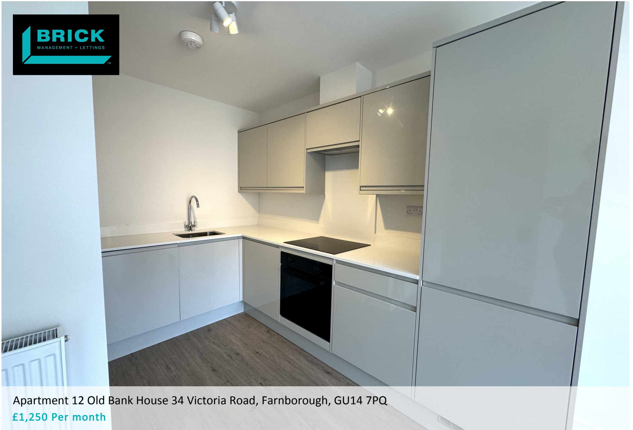
Apartment 12 Old Bank House 34 Victoria Road, Farnborough, GU14 7PQ £1,250 Per month